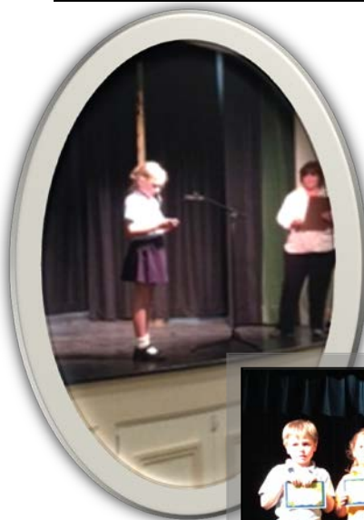
Some of our public speaking prize winners.